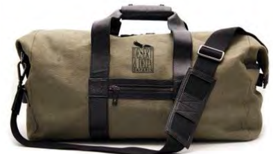
SOFT SIDED BAGS ONLY