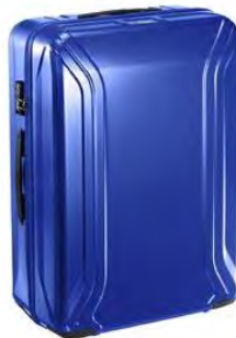
NO HARD BODY CASES