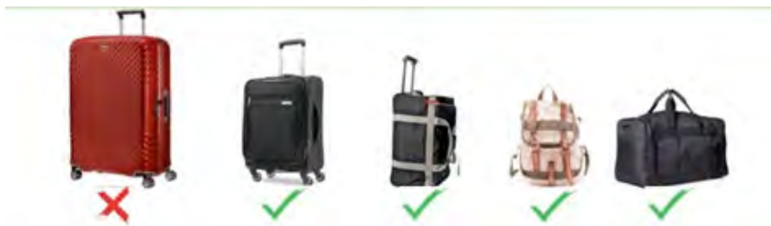
HARD-SIDED BAGS NOT PERMITTED