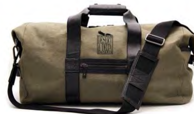
SOFT SIDED BAGS ONLY