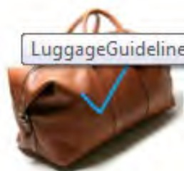
SOFT SIDED BAGS PERMITTED