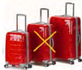
HARD SIDED BAGS NOT PERMITTED